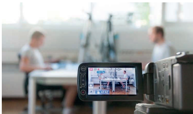
Figure 1 Two participants working on a CAD task while the postures are being monitored

The participants received a standardized and randomized CAD task to be solved under observation with a traditional setup of keyboard and mouse in NX 10. After a training period of one week with a provided 3D mouse, a second, similar task was given to be solved with a 3D mouse. The two tasks were of similar difficulty but required a different set of tools to solve. During the tasks all mouse movements and clicks were logged as well as the body posture monitored (see Figures 1 and 2).